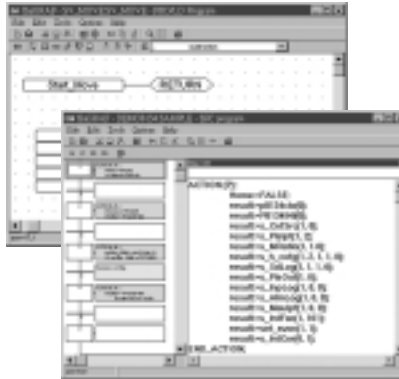
ISaGRAF C-function library